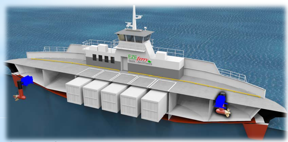
Concept Sketch EZEferry